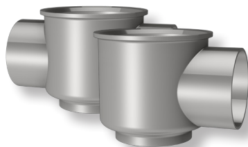
Housings right angle and double right angle